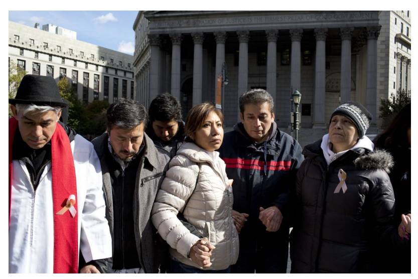
A group of immigrants held a protest march for immigration reform in New York City in October.

Democrats and some Republicans push to keep protections for those who came to U.S. as children